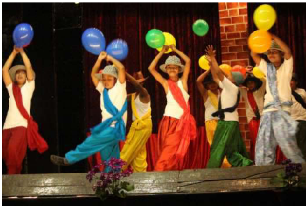
Betten House & Cable House concert 2017