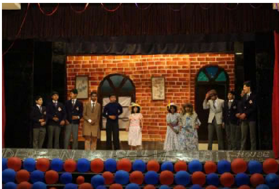
Anderson House & Westcott House concert 2017