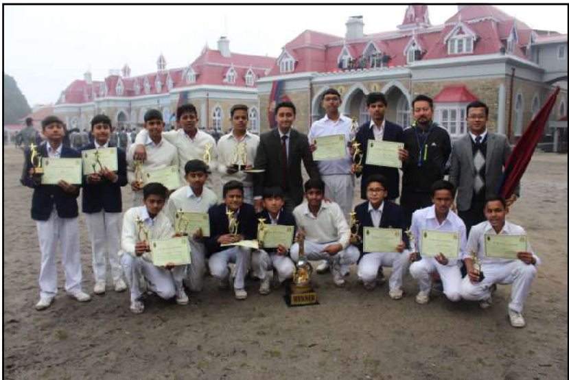
St. Paul's School team, winners of the inaugural "The Paulite Under-14 T20 League", 2017