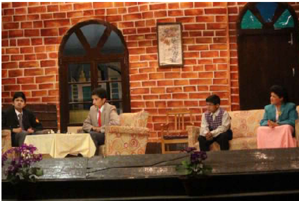
Betten House & Cable House concert 2017