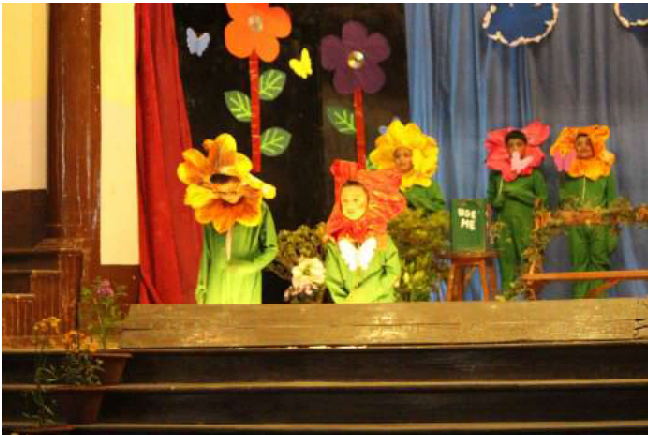
Hillary House in action 2017