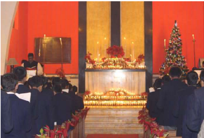
Junior Wing Carol Service 2017