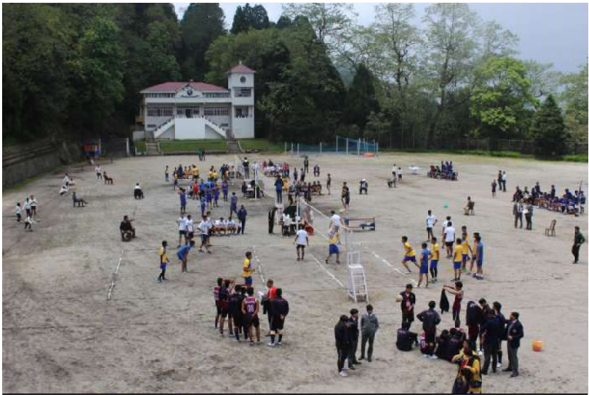
The Inter School Volleyball Carnival, 2017