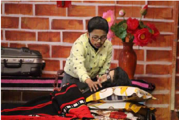
Hunt House in action 2017