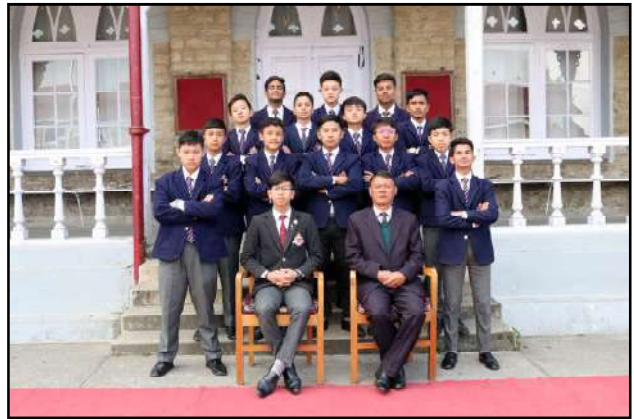
Under X Football Team 2018