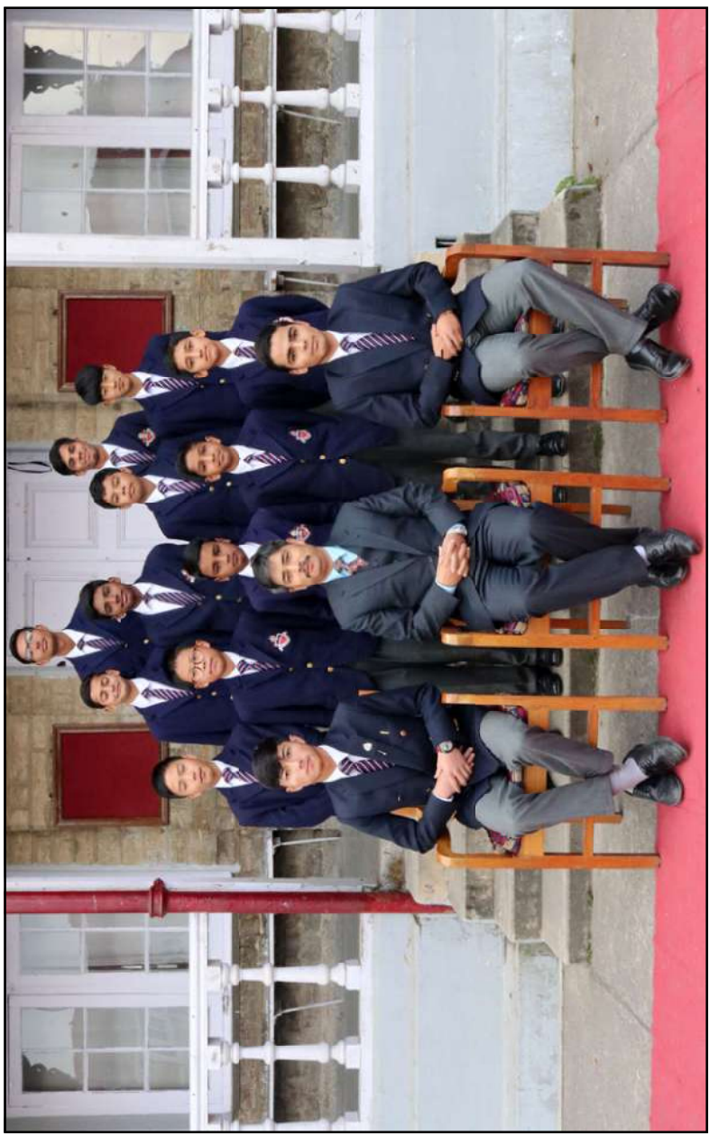
Table Tennis 2018