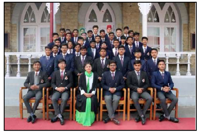
Textile Designing Hobby 2018