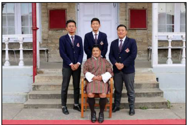
Dzonkha Society 2018