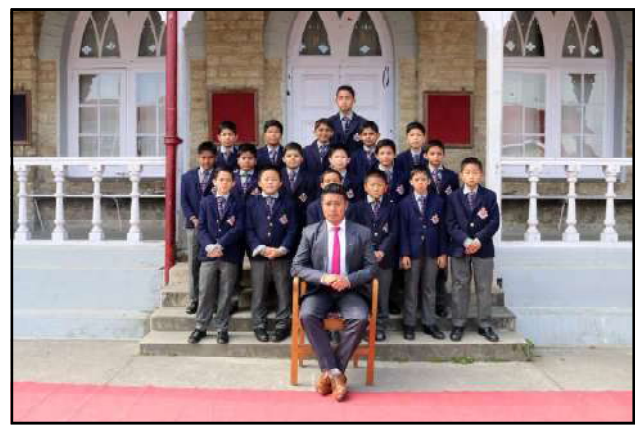
PW Football Team 2018