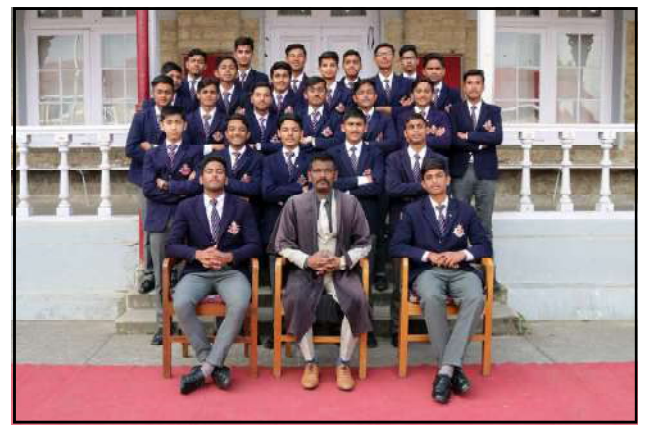
Under X Cricket Team 2018