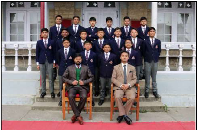
JW Cricket Team 2018