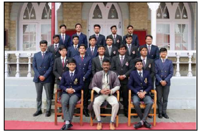
Plus 2 Cricket Team 2018