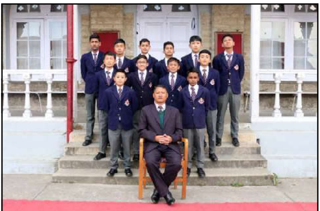
JW Football Team 2018