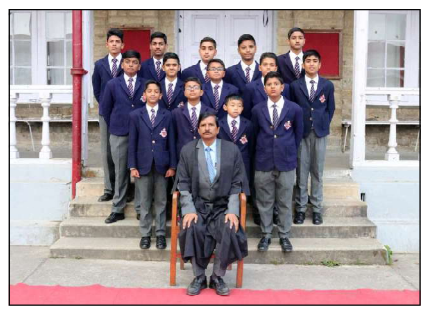
JW Hindi Elocutionists 2018