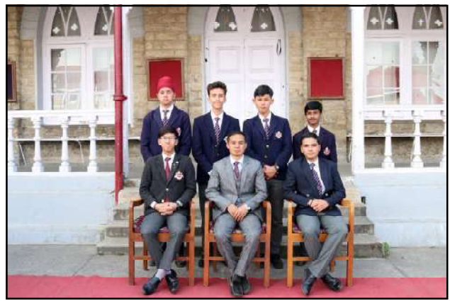
Computer Society 2018