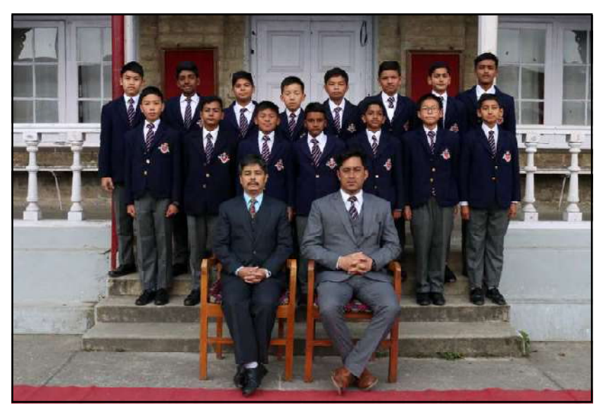
JW Racquet Games 2018