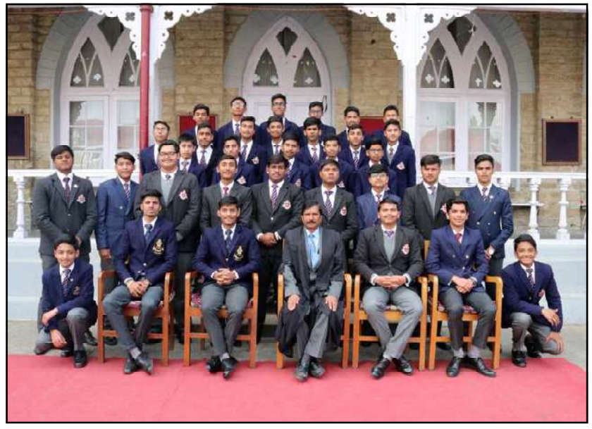
Hindi Parishad 2018