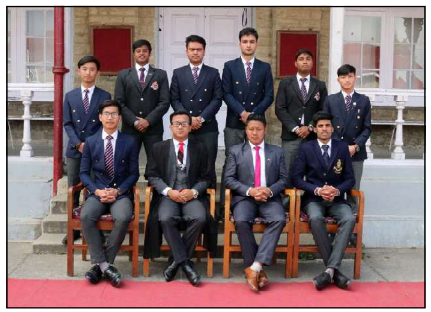
Plus 2 Basketball Team 2018