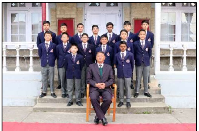
Under 8 Football Team 2018