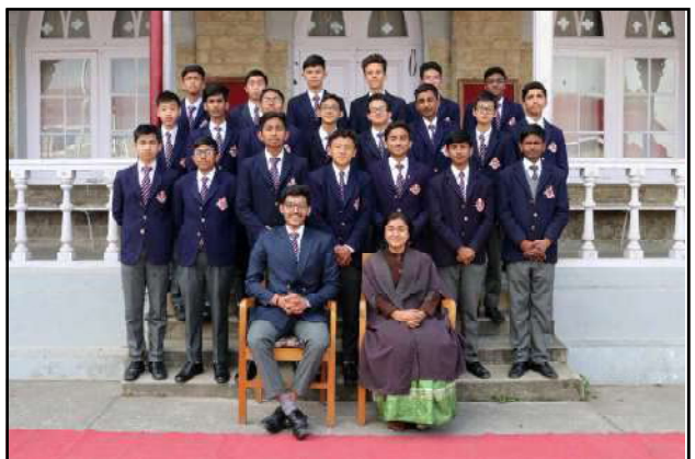
Origami Hobby 2018