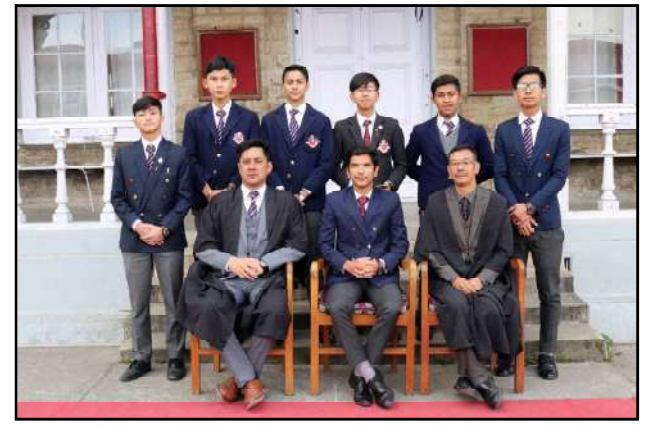
Media and Adventure 2018