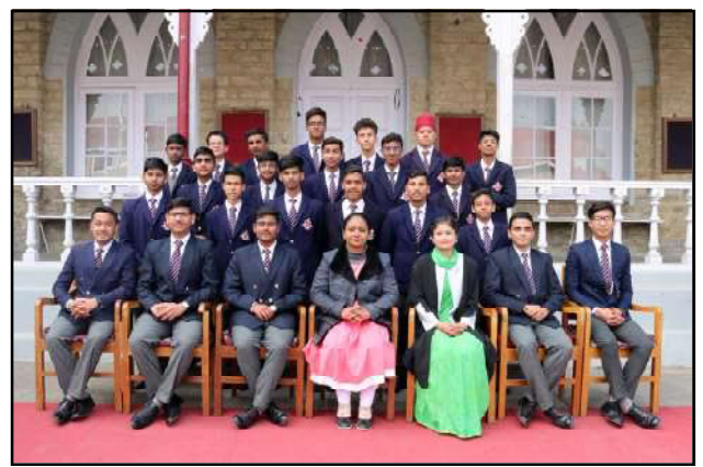
Science Exhibition 2018