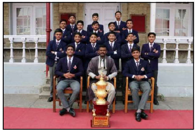
Under 16 Years Cricket Team 2018