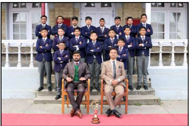
Under 14 Years Cricket Team 2018