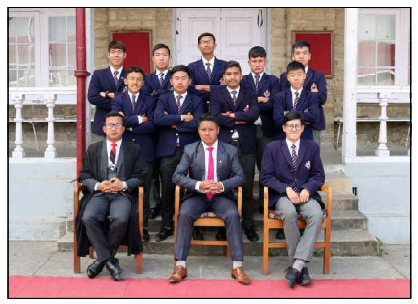
Under X Basketball Team 2018