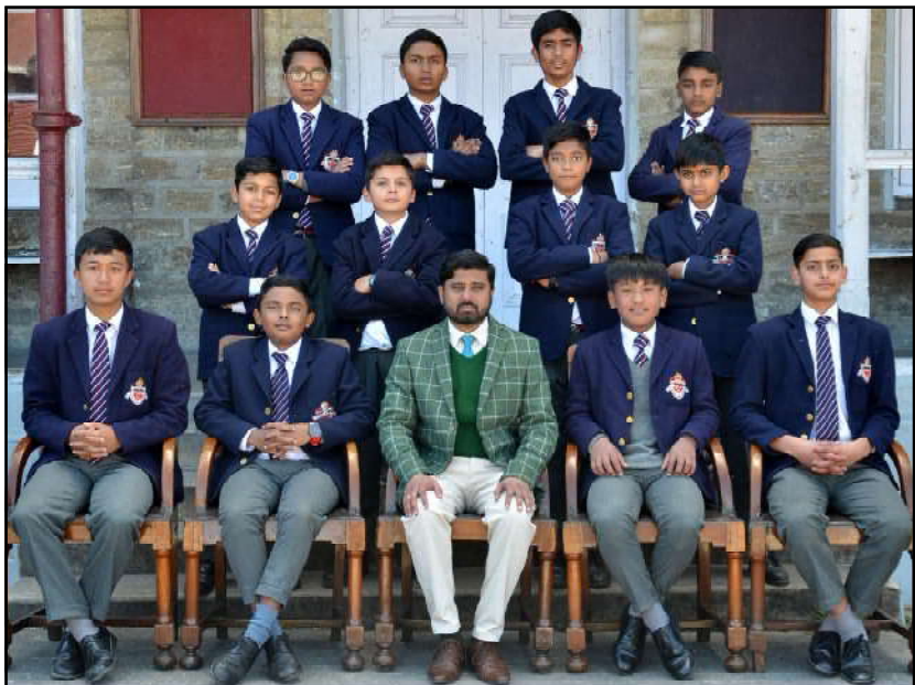
Under 14 Cricket Team, 2019