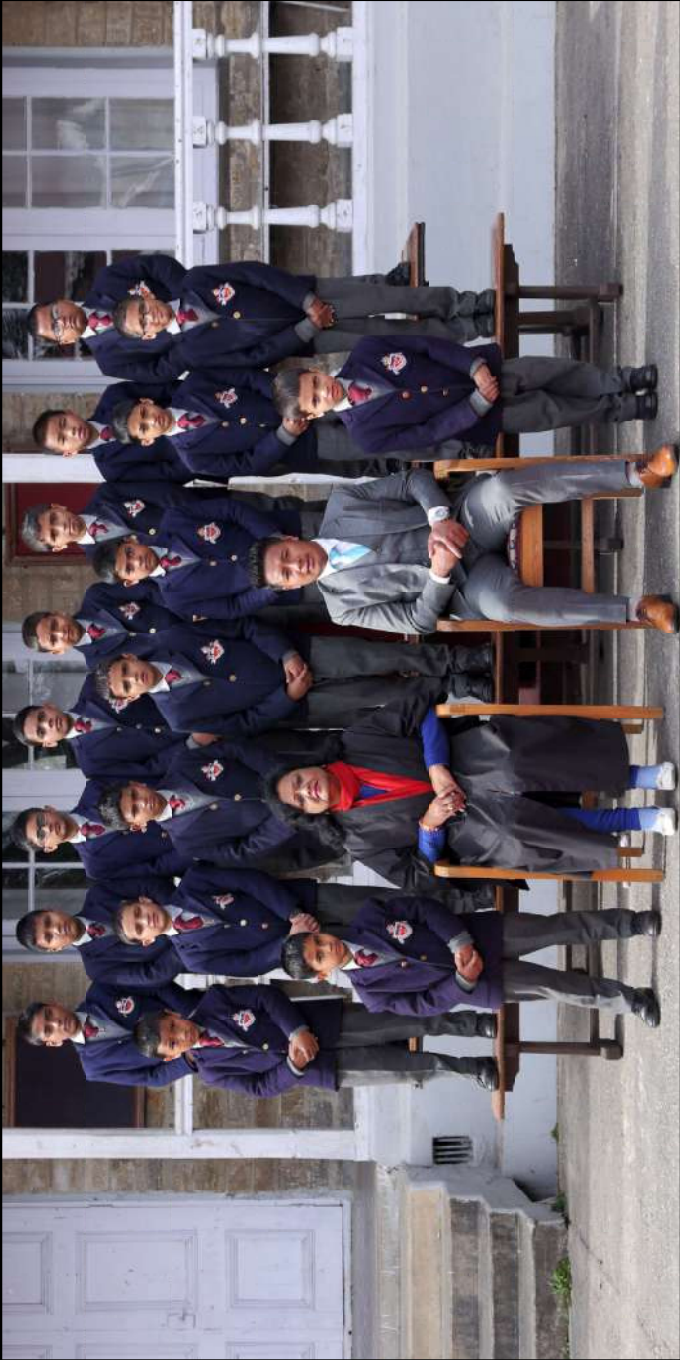
Hunt House, 2019