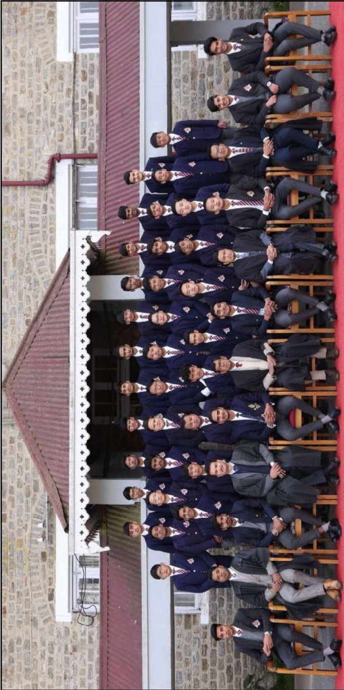
Hastings House, 2019