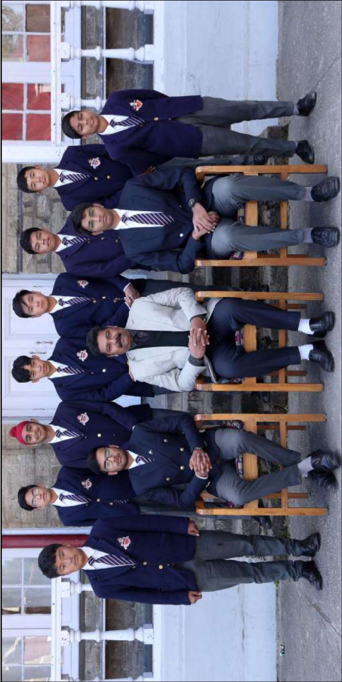
Chess Team, 2019