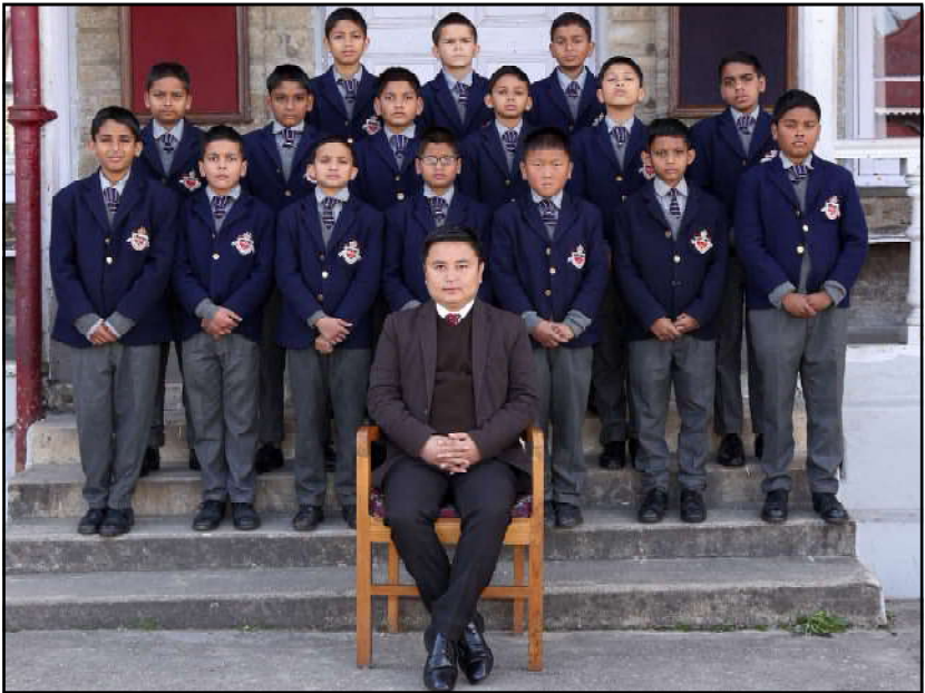
PW Football Team, 2019