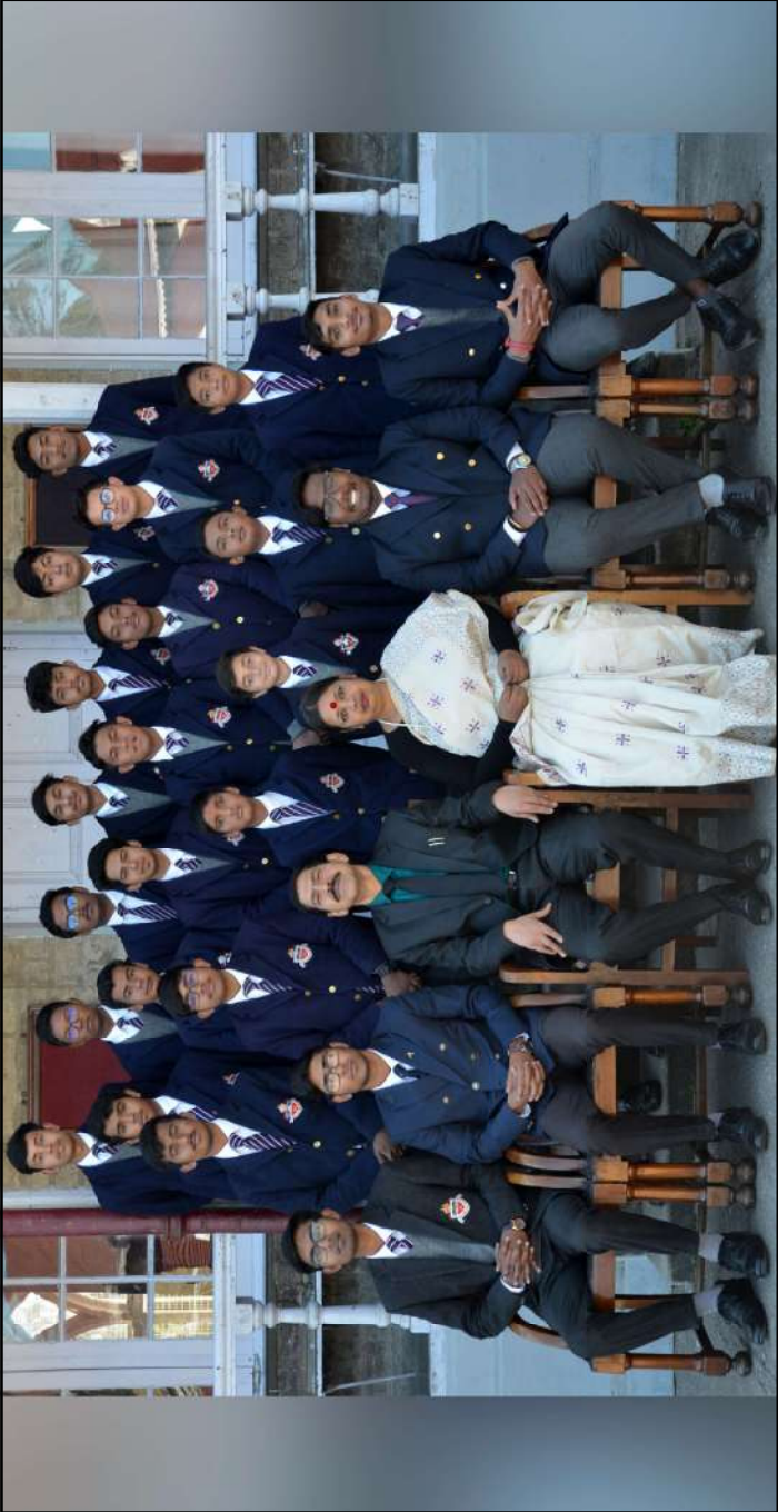
Bengali Society, 2019