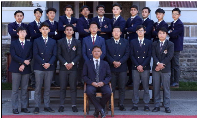
Football Team, 2019