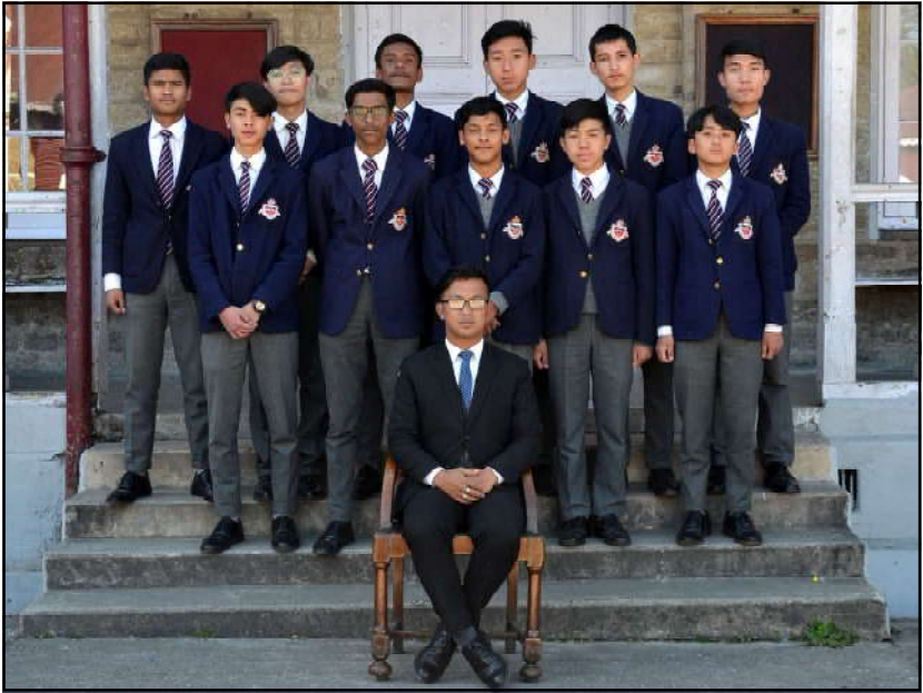
Under X Basketball Team, 2019