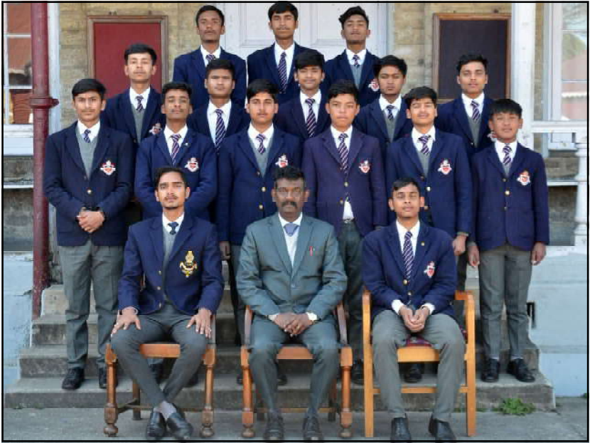
Under X Cricket Team, 2019