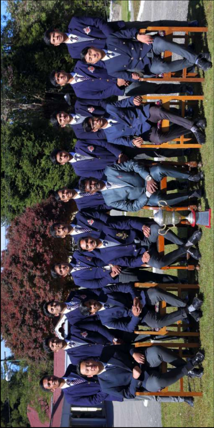
Edinburgh Cricket Team, 2019