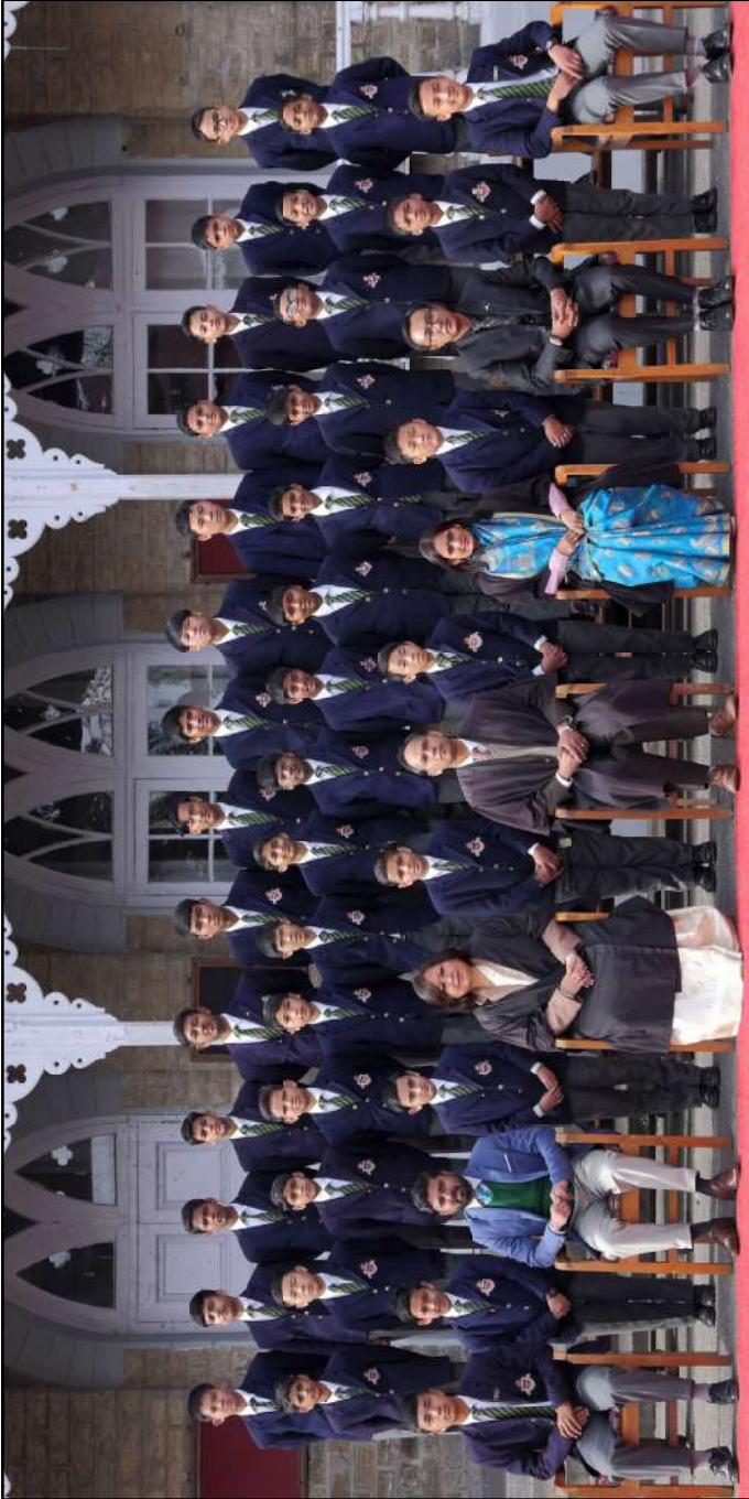
Cable House, 2019