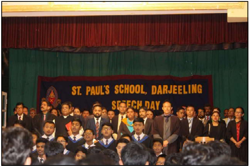
Speech Day 2019