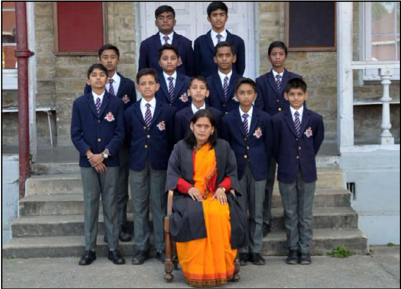
Hindi Elocution Team, 2019