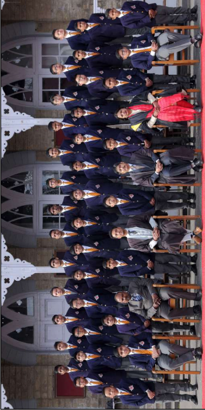
Bettan House, 2019