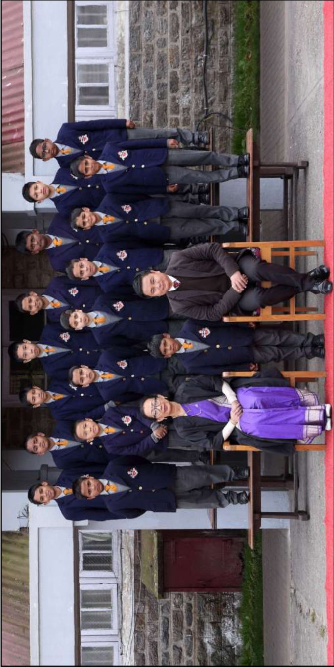
Everest House, 2019