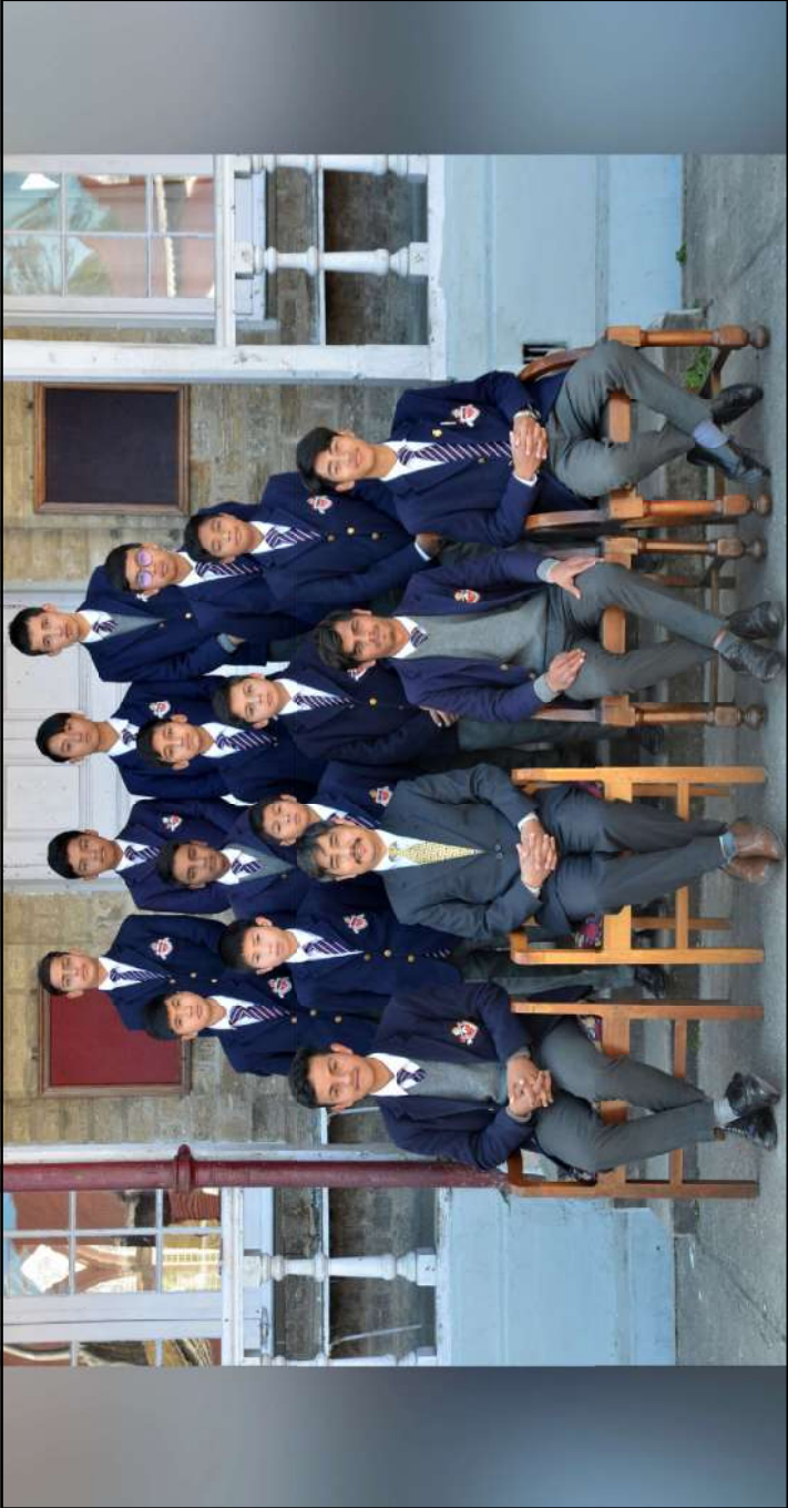
Table-Tennis Team, 2019