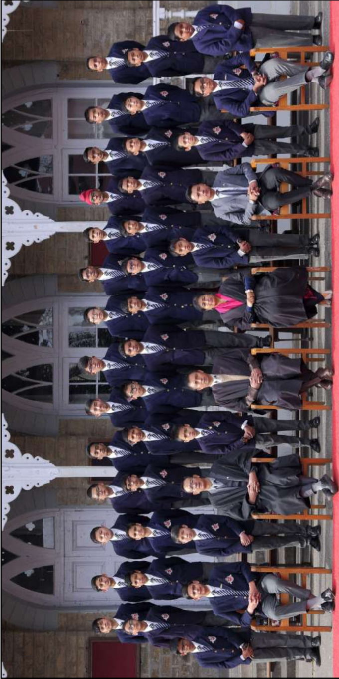
Westcott House, 2019