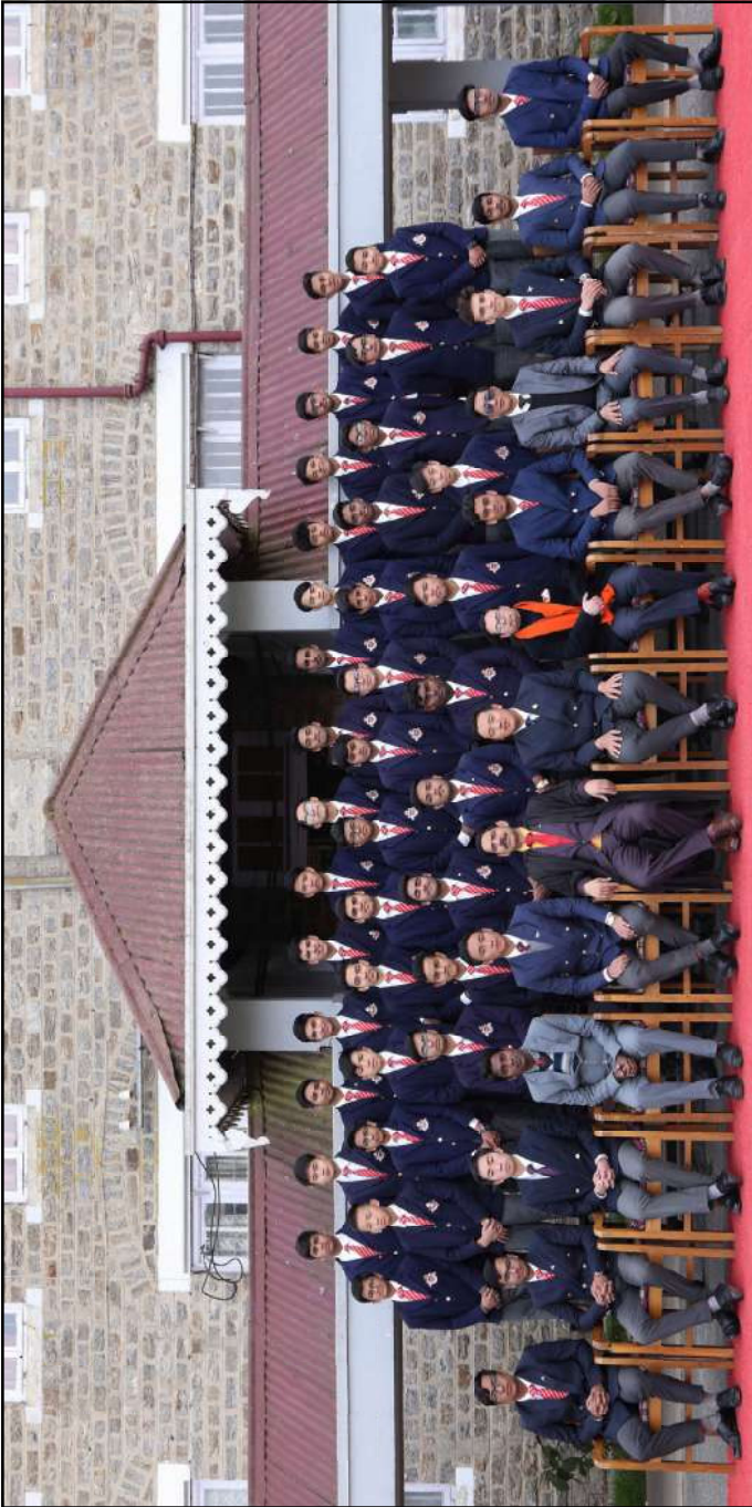
Clive House, 2019