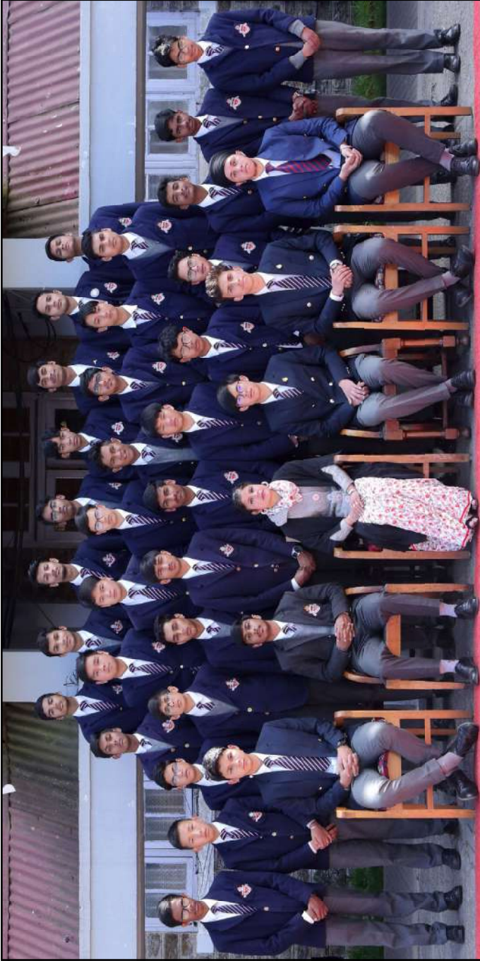
Textile Designing Hobby