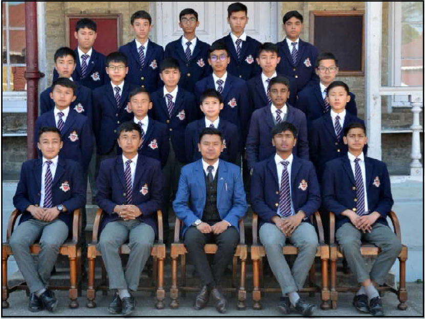
JW Football Team, 2019