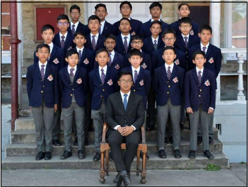
Under 7 & 8 Basketball Team, 2019