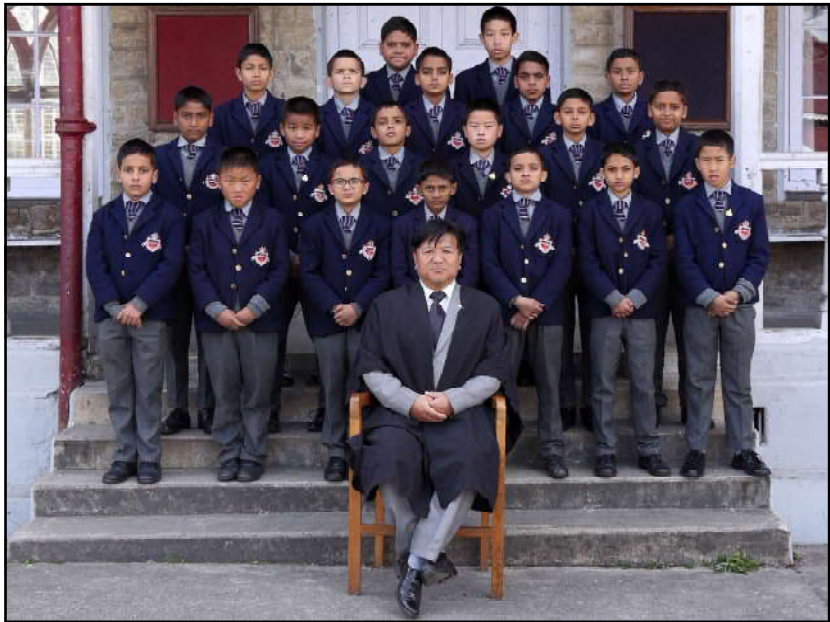
PW Cricket Team, 2019