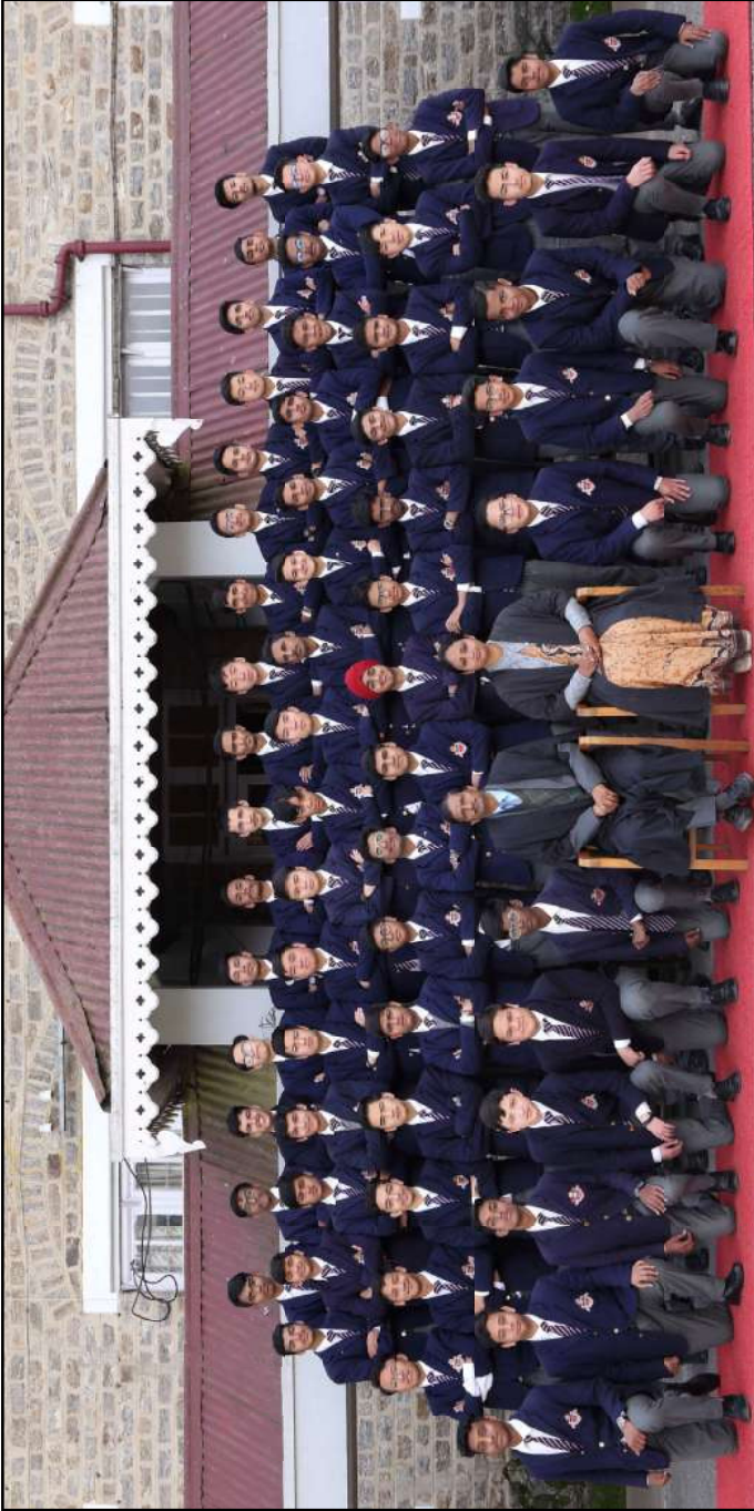
The ICSE '19-'20 Candidates