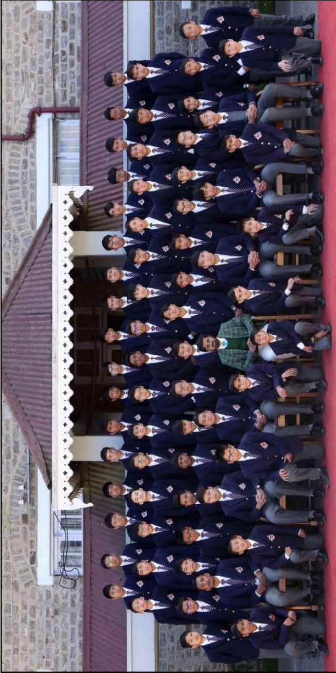
French Society, 2019