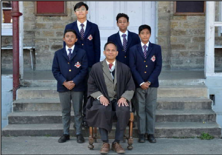
N. M. Master Elocution Team, 2019