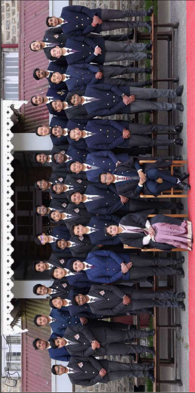
The ISC '19-'20 Candidates