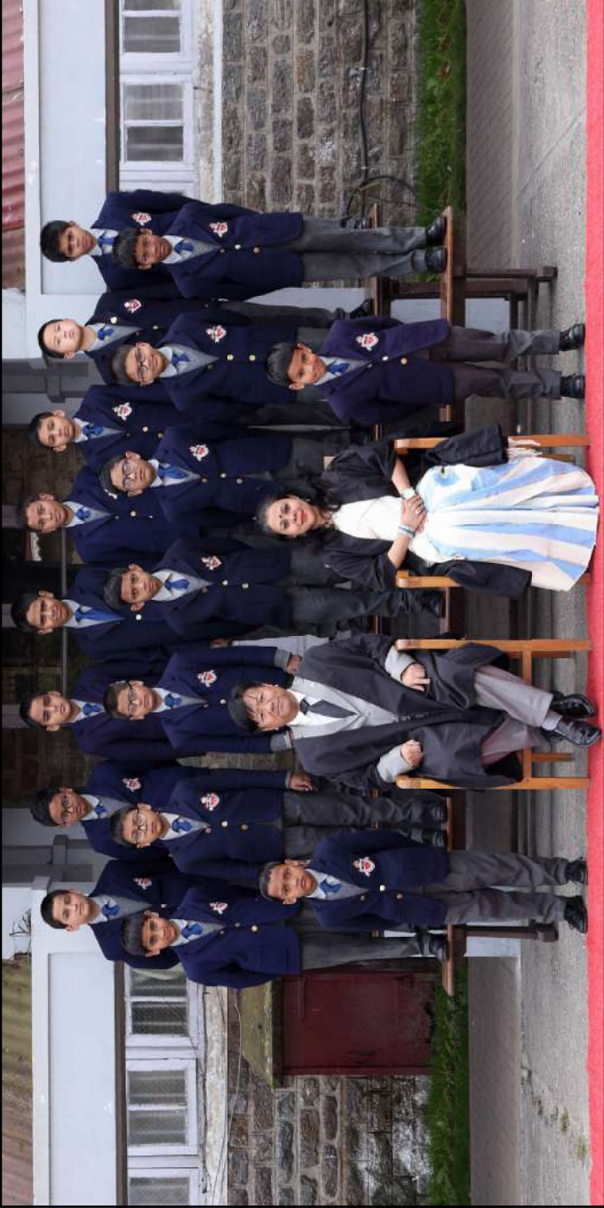
Tenzing House, 2019