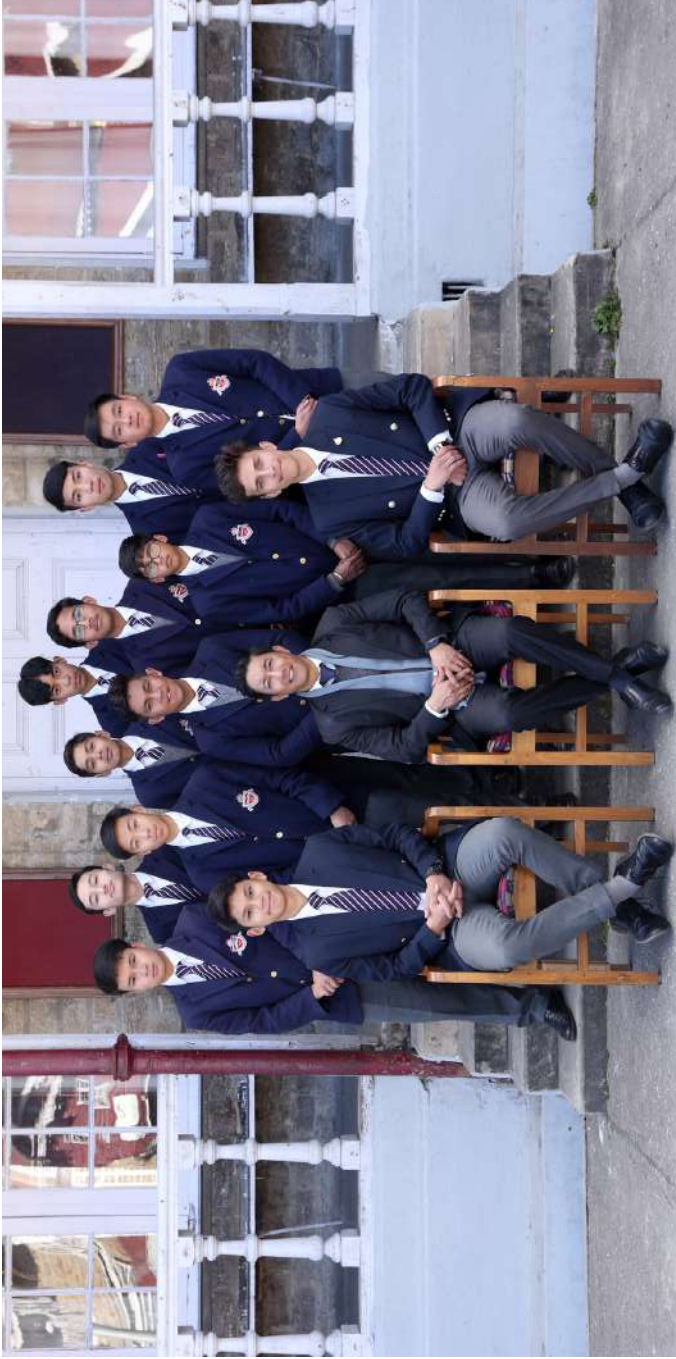
Photography Hobby, 2019