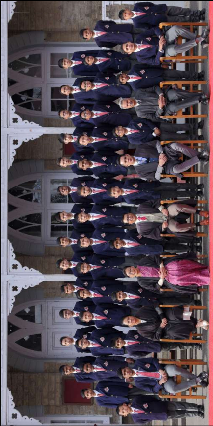
Anderson House, 2019