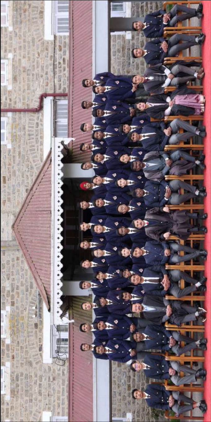
Lawrence House, 2019