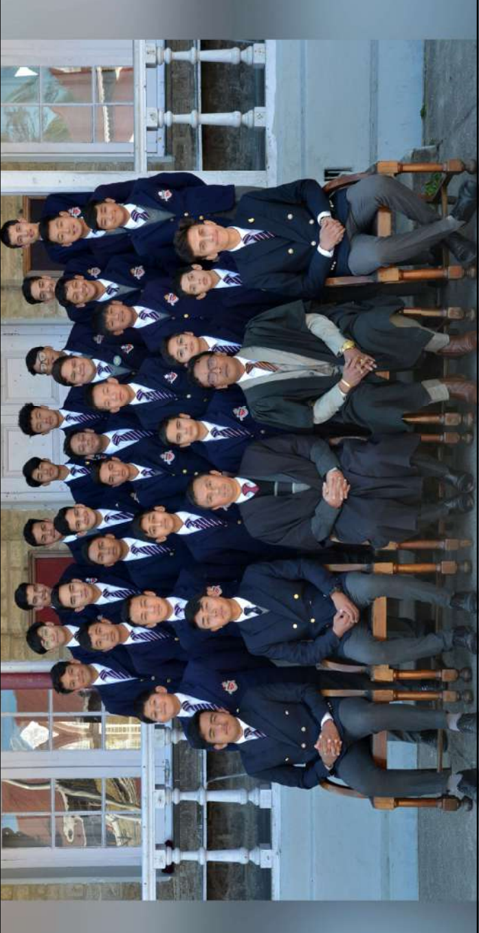
Nepali Society, 2019