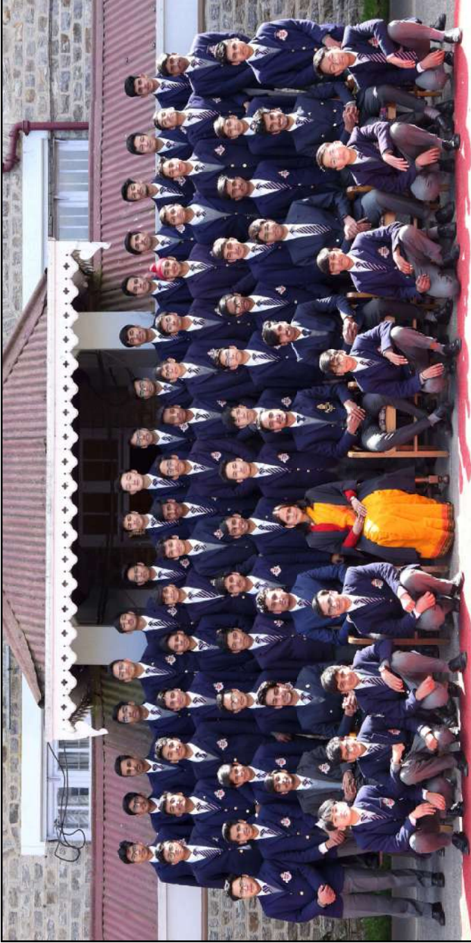
Hindi Parishad, 2019