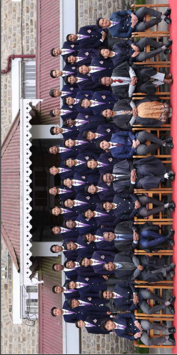
Havelock House, 2019