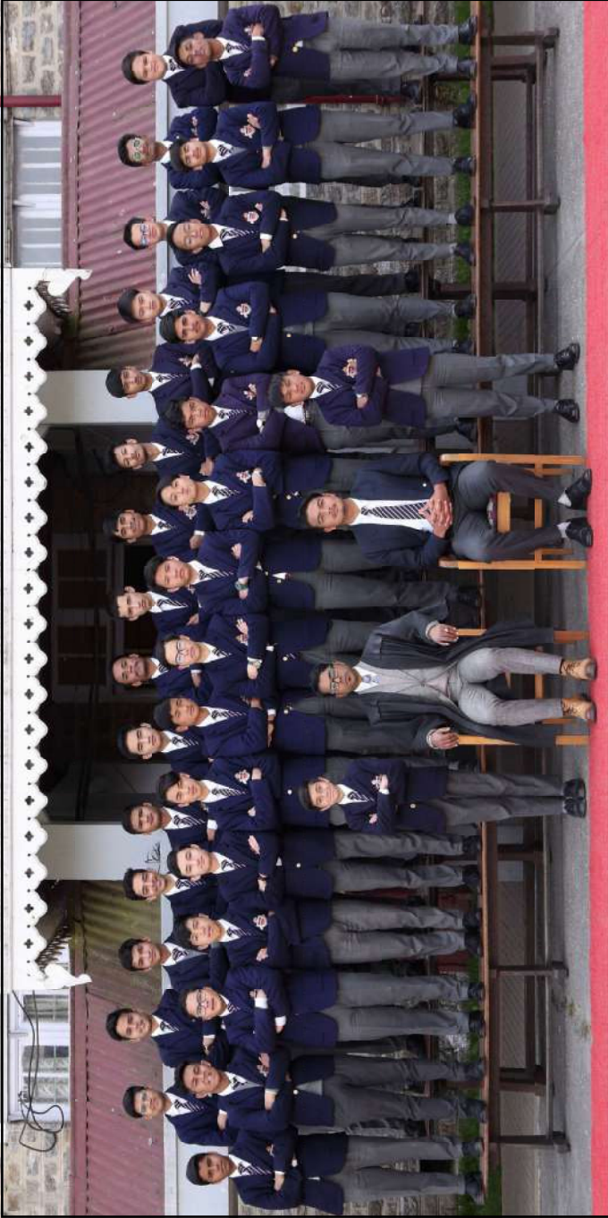
Art & Craft, 2019