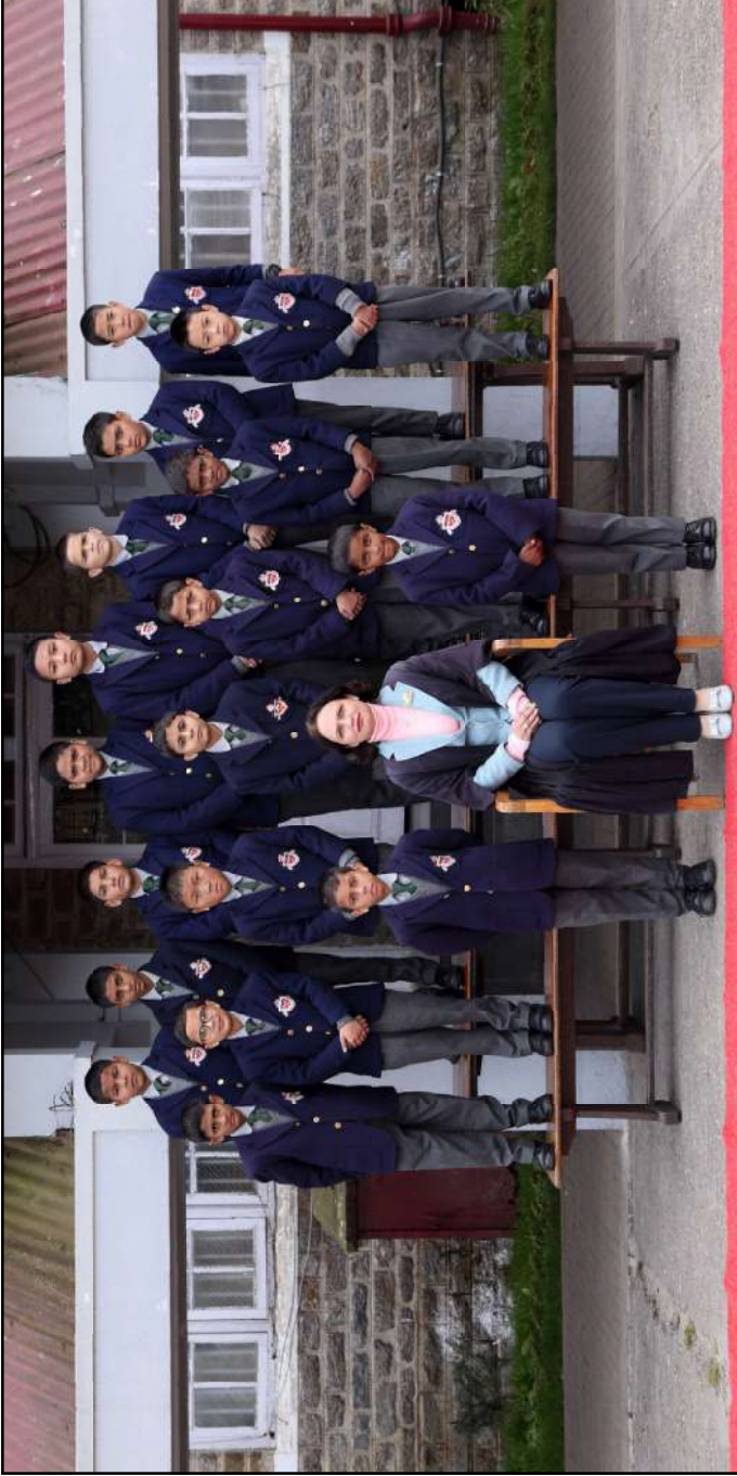
Hillary House, 2019