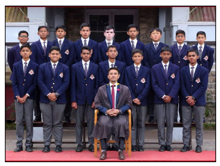
Junior Wing Cricket Team