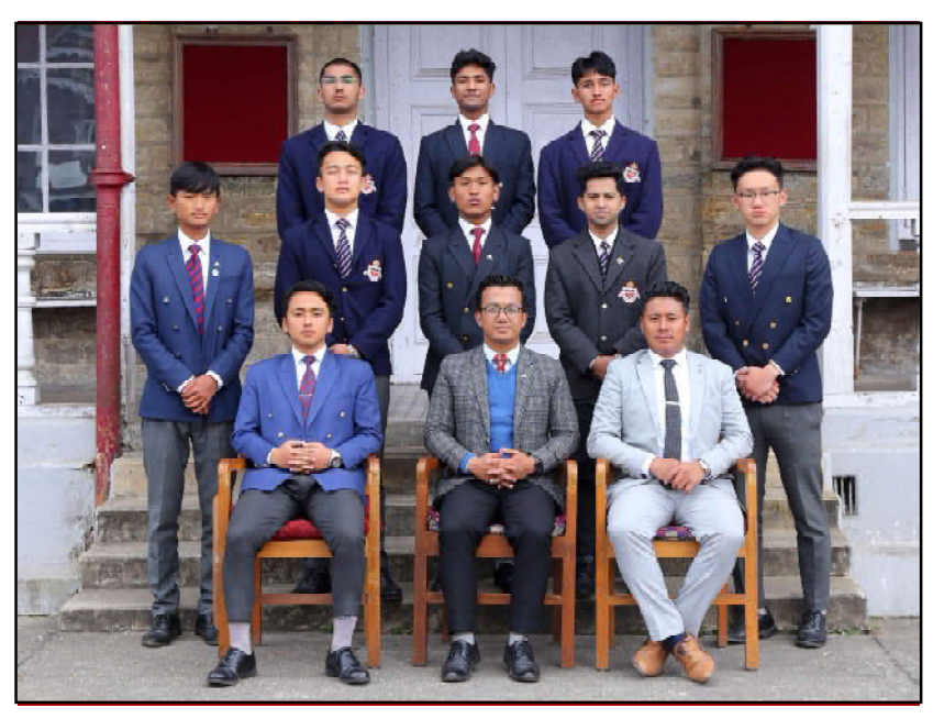
ISC Basketball Team, 2022