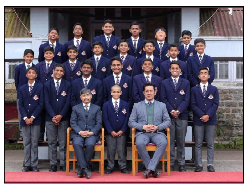
Junior Wing Racquet Games Enthusi-