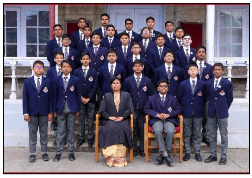
Junior Wing Debating Team