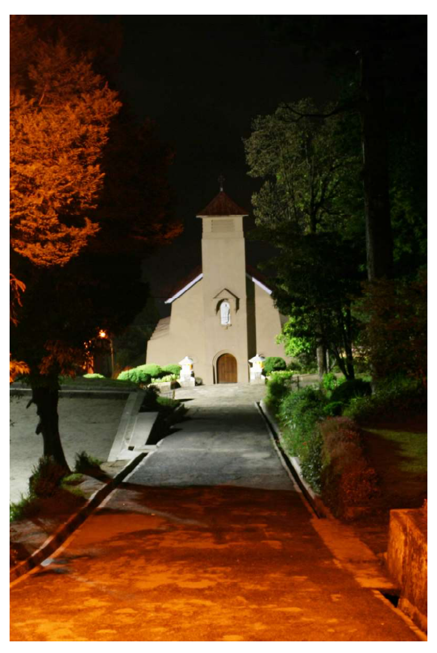
The School Chapel