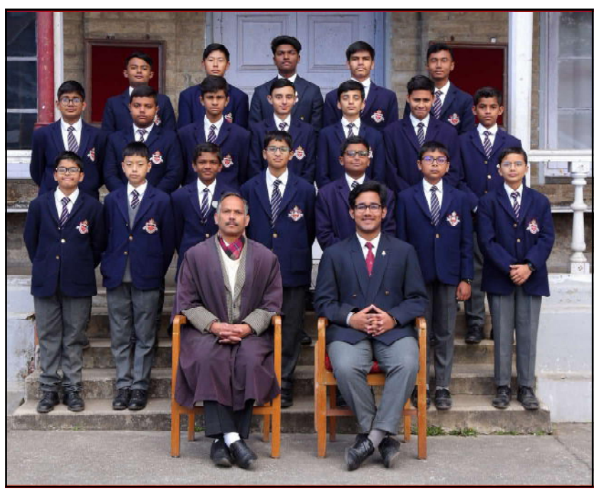
English Elocution Team, 2022