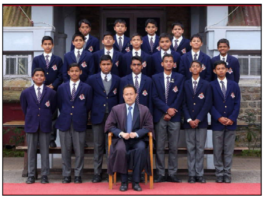
Junior Wing Quizzing Team