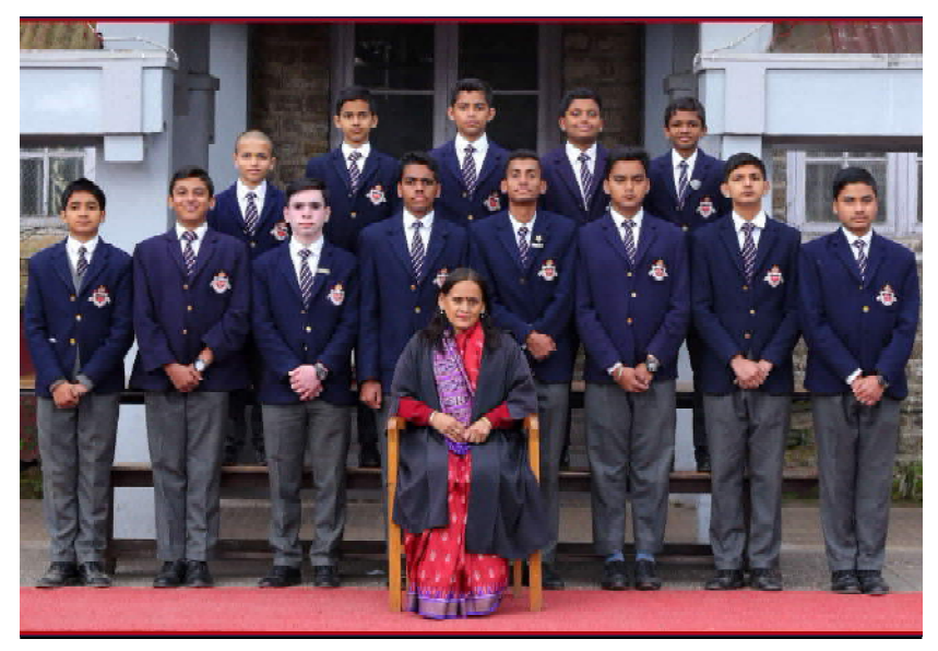
Junior Wing Hindi Elocution