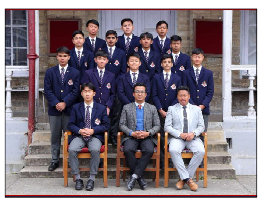
ICSE Basketball Team, 2022